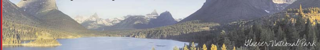
Glacier National Park

August 22 - Sept. 4 & Sept. 12 - 25, 2010