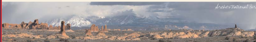
Arches National Park

3rd/4th persons sharing a room pay $1995 per person. No additional taxes or fees.