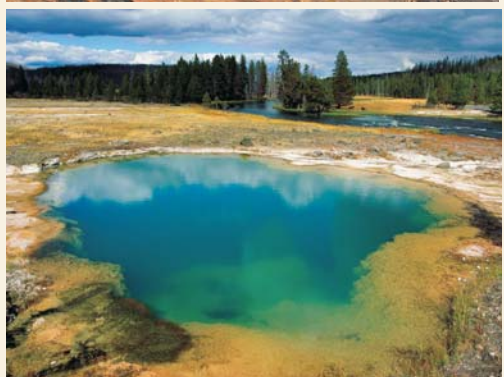
Morning Glory Pool - Yellowstone