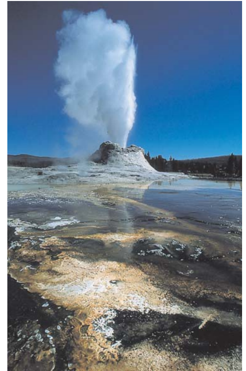
Castle Geyser at Yellowstone National Park. Yellowstone has more than 10,000 geysers, hot springs and fumaroles (steam vents).